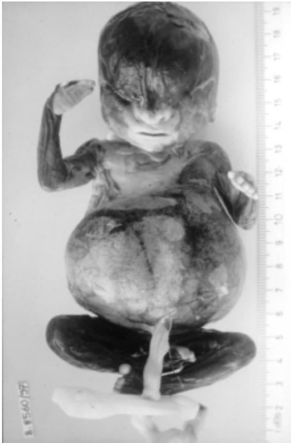
Figure 1. Gross view of the fetus: stillborn male fetus at 19 week of gestation.

External abnormalities: Slightly large head, low set ears, fusion of the eyelids with globes properly placed, wide and depressed nasal root, chin smaller than normal, syndactyly, distended abdomen due to fetal ascites, lomber spina bifida, imperforated anus and maceration observed.