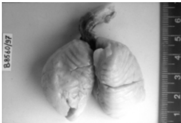
Figure 2. Grossly both of the lungs are firm and bulky, showing depressions on the surface due to thoracic cage pressure. A few scattered small cysts 0,1-0.2 mm in diameter seen both on the surface and in the cross section of the lungs.

External abnormalities: Slightly large head, low set ears, fusion of the eyelids with globes properly placed, wide and depressed nasal root, chin smaller than normal, syndactyly, distended abdomen due to fetal ascites, lomber spina bifida, imperforated anus and maceration observed.